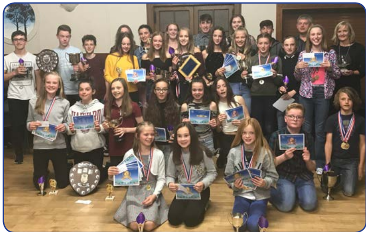
BSAC 2018 Trophy & Certificate Winners at the Annual Ceilidh and Awards evening